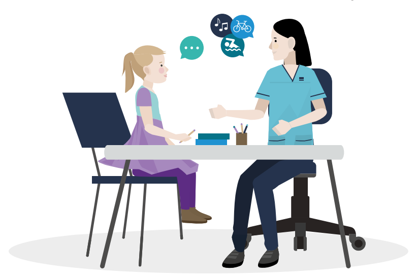
Find out how you can be an occupational therapist: www.careers.nhs.scot/occupational-therapist

If you're creative, a problemsolver, and have good communication skills, this is the role for you.